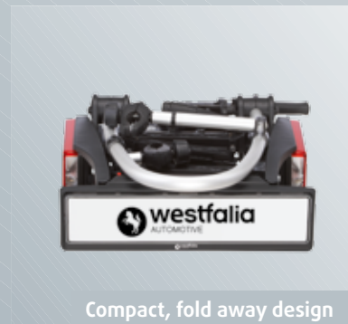
Compact, fold away design